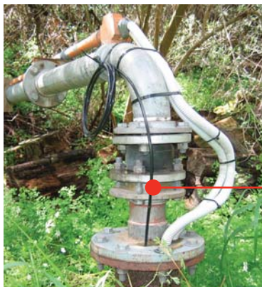
Gunmetal wafer type valve mounted between flanges